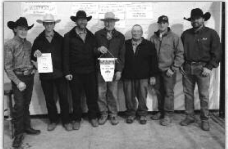
3rd Place Pen Of 5 - Spring Valley Colony