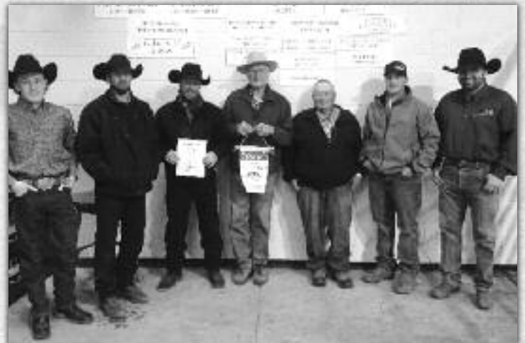
5th Place Pen Of 5 - Spring Point Colony