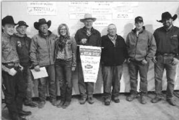
Reserve Pen Of 5 - Dunlop Ranch