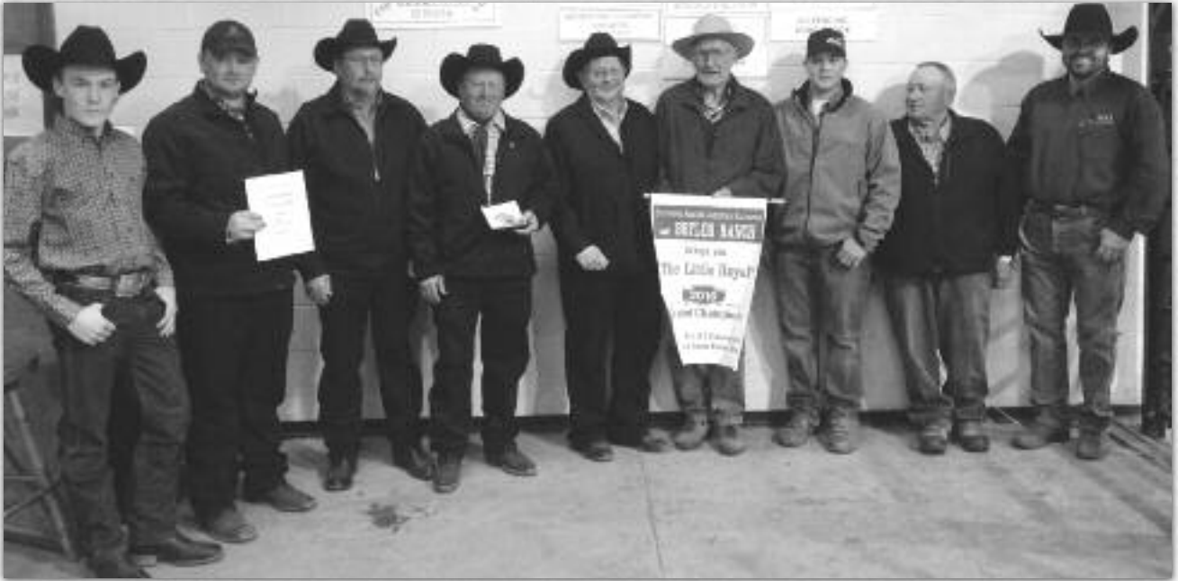
Grand Champion Pen Of 5 - Granum Colony