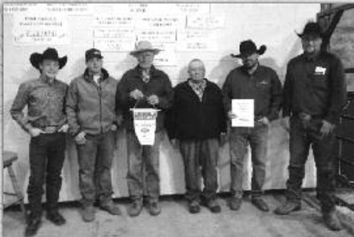
4th Place Pen Of 5 - C & B Ranch