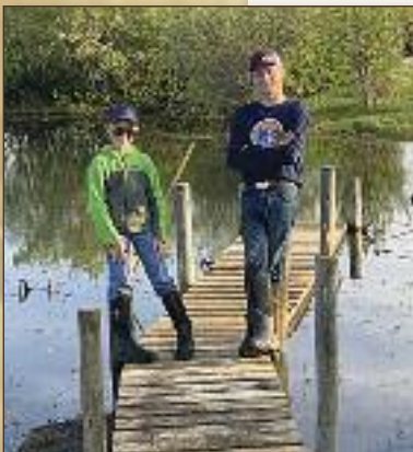
Rowan & Deloy built a dock "Summer Project"