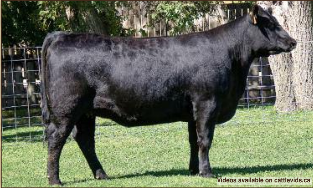
Videos available on cattlevids.ca