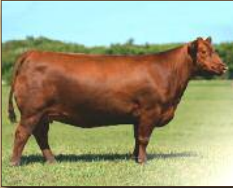
VIDALIA 24Y - DAM OF LOT #29 & #30 EMBRYOS