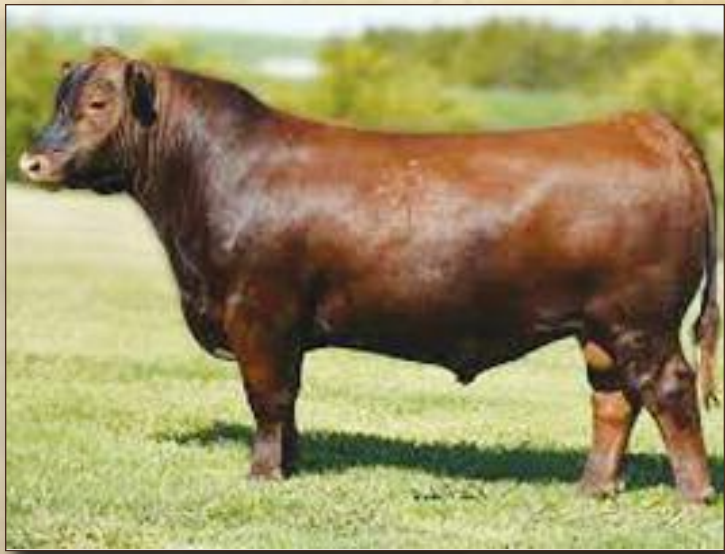
FRANCHISE 6305 - SIRE OF 613F