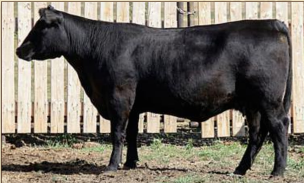
LOT #49 - RACK QUEEN 6F