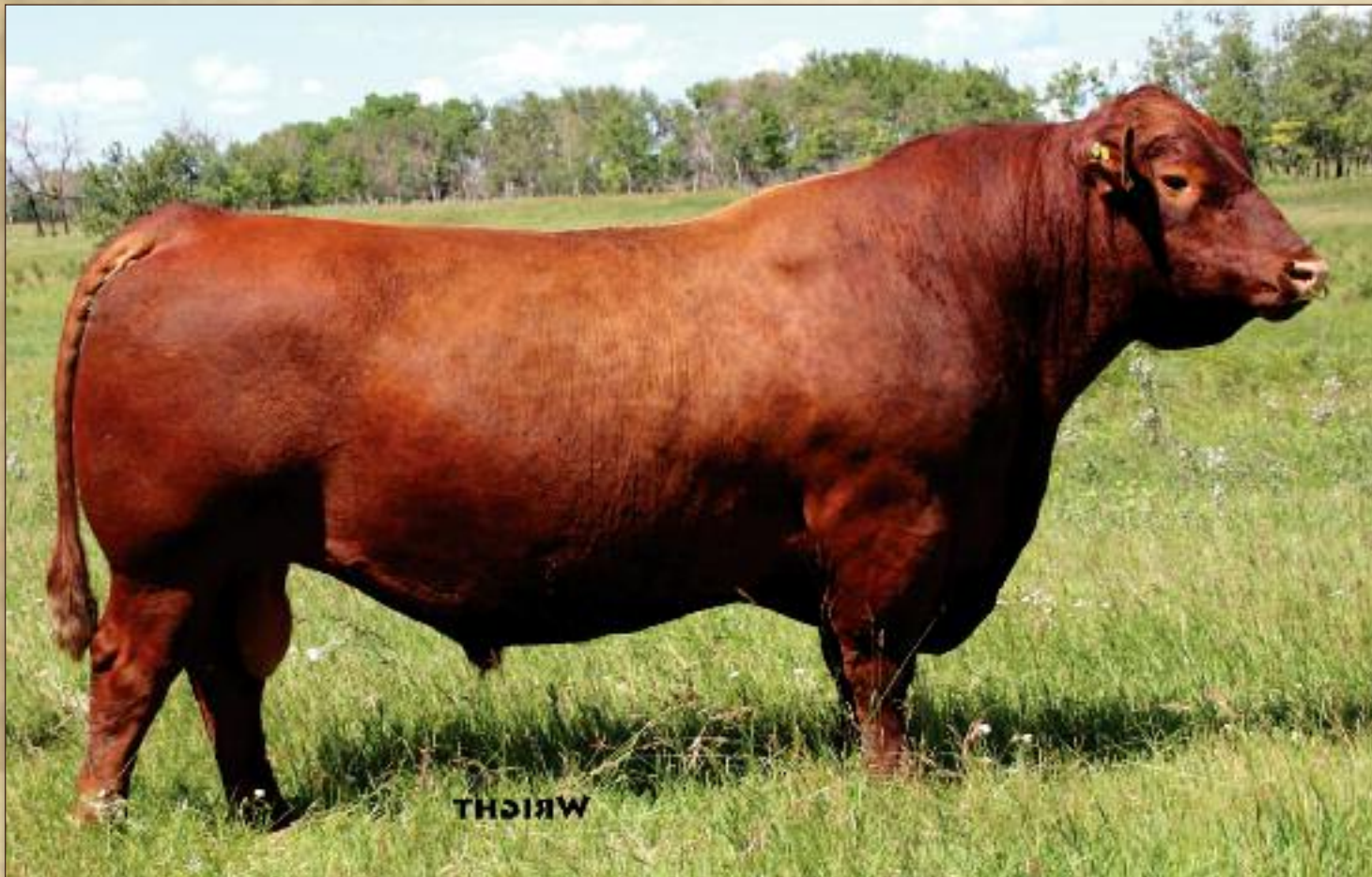
REF SIRE & SEMEN PACKAGE - RED COCKBURN ASSASSIN 624D