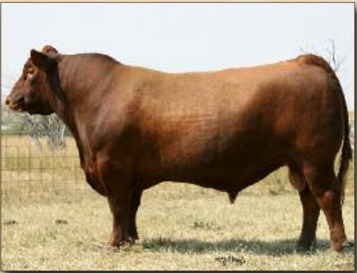
MULBERRY 26P - SIRE OF 408C