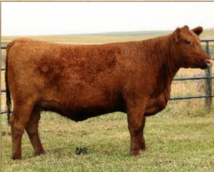
LOT #16 - RED BRYLOR 49B BONITA 14G

The grandam, MJ Trina 6N, had 24 calves registered out of her at CAA.