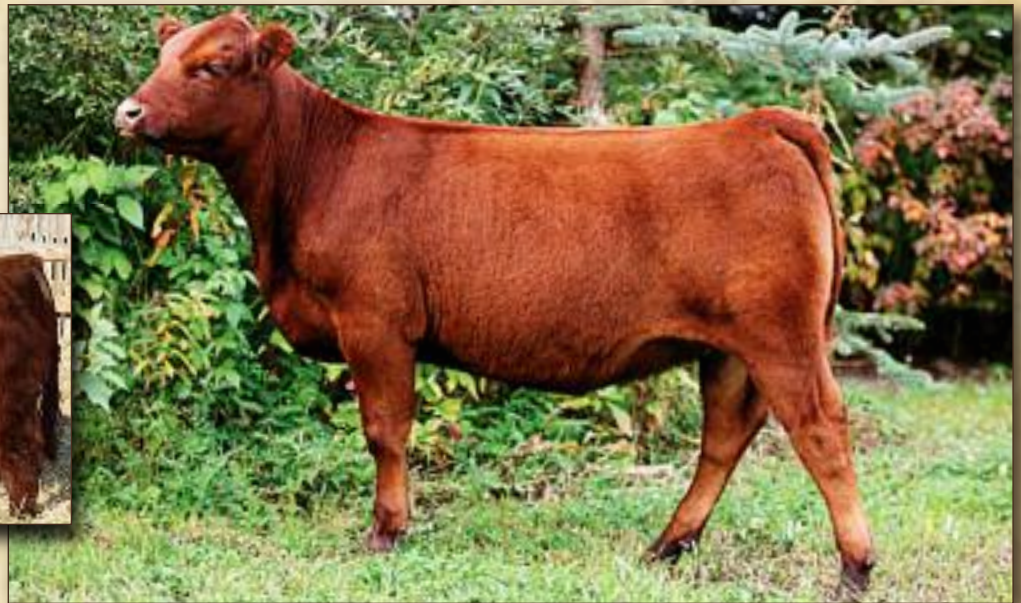
LOT #45 - RED DELTA LITTLE DE LAKE 406H