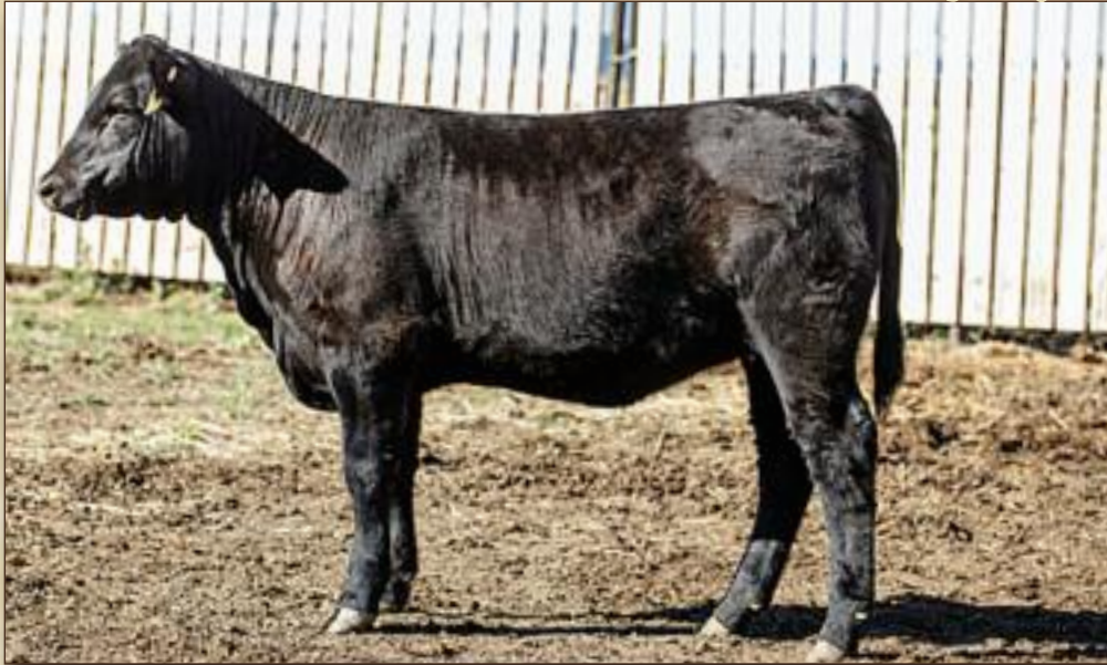
LOT #48 - RACK QUEEN 212H