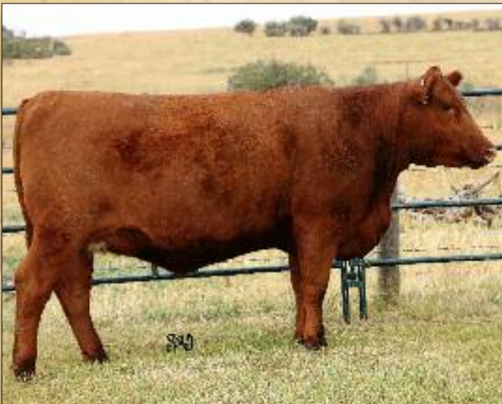
LOT #12 - RED BRYLOR 7X PIN JASMINE 7G

A.I.'ed to the $27,000 Franchise son, 149F.