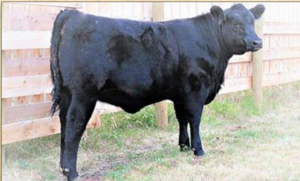
LOT #47 - HVA PRIDE 9H

This open heifer is going to be a bigger framed momma cow. Here is the perfect opportunity to increase your herd's diversity by adding this female to your program, one that will go on to make those unique dark colored bulls.