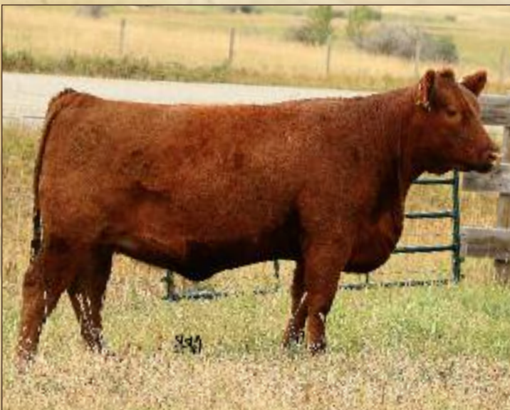
LOT #26 - 211G

From the same family 257G comes from as 26G in Lot #17 today. She weighed 1085 on March 22nd. She has a nice look and exceptional length of body.