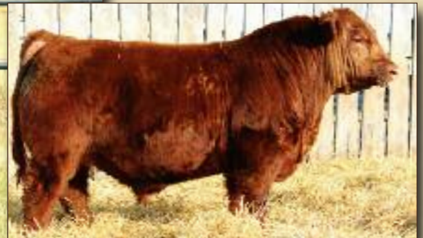
RESOURCE - SIRE OF LOT #6