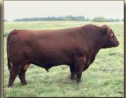
UPLOAD - SIRE OF LOT #30 PREGNANCY