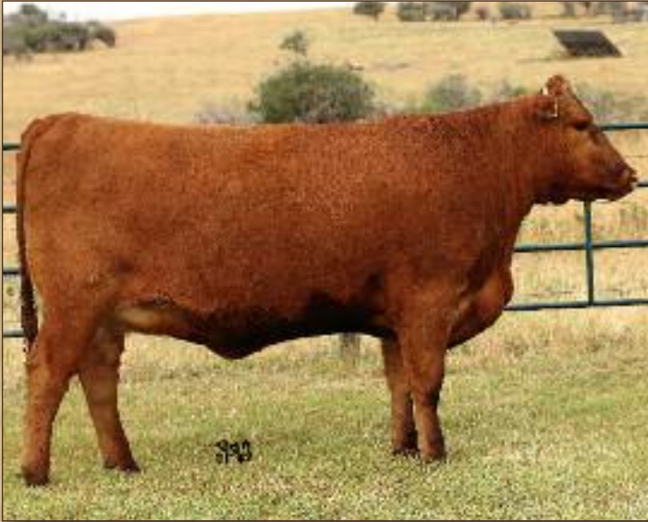
LOT #14 - RED BRYLOR 27X BAYBERRY 11G