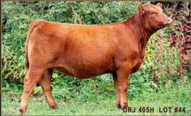
DRJ 405H LOT #44

SATURDAY • OCTOBER 24 2020 • STAVELY AUCTION MARKET STAVELEY, ALBERTA 1:00 PM (MDST)