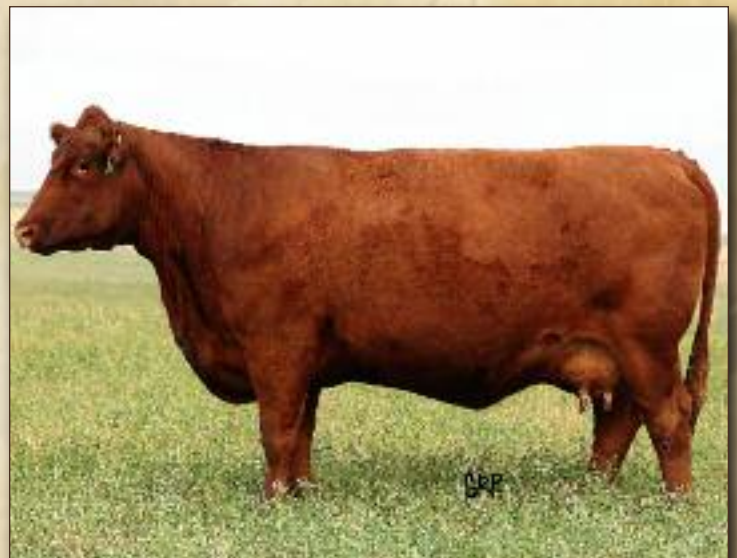
LOT #9 - RED BRYLOR MISS TST 61A

Marshall has two feature maternal sisters from Mar Mac in Red Roundup 2020.