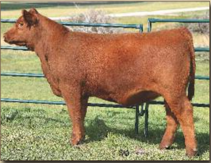
72A - FULL SISTER TO DAM, 408C