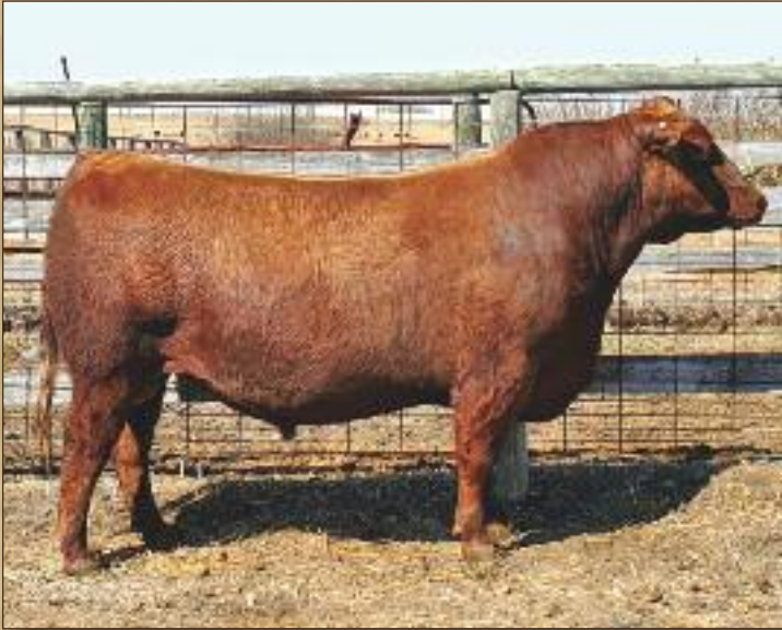
SERVICE SIRE A - RED BRYLOR OTM FRANCHISE 149F