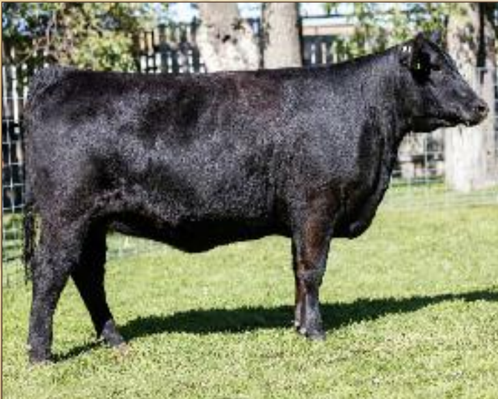
LOT #38 - FLEMING 901 ELENOR

Fleming 912 Jena Spur is a female with a pedigree that is packed with maternal and performance traits. The tried and true genes of Fleming 921 Jena, Bar WL Lady 88A, TC Stockman 365, N Bar Emulation EXT on the dam side and Connealy Spur on the top side of the pedigree produce herd builders that stay in the herd and produce top progeny year after year. She has built-in proven performance and longevity in her pedigree. Jena Spur is a complete deep square made female that carries down into her twist. She is a clean fronted female that will be a great addition to your herd. Videos available on cattlevideos.ca