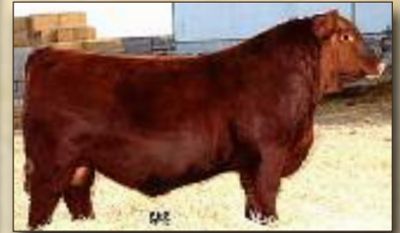
BLUE COLLAR 295E - SIRE OF LOT #46