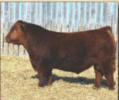
ASSASSIN - SIRE OF LOT #5

Study these Assassin daughters, too, for their great femininity and overall profile and they are good cattle bred to the $13,000 flawless footed Service Sire from Howes', Head Games 56G.