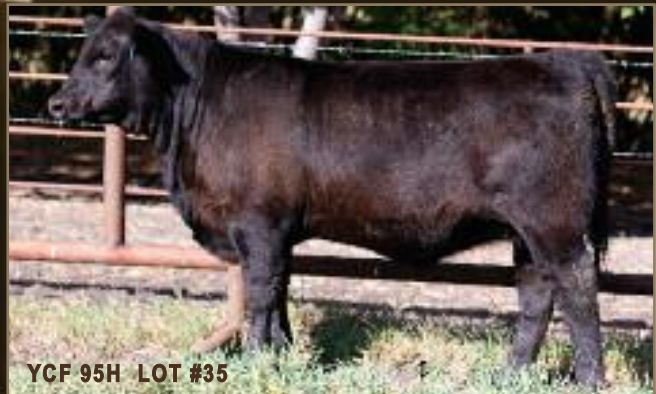
YCF 95H LOT #35