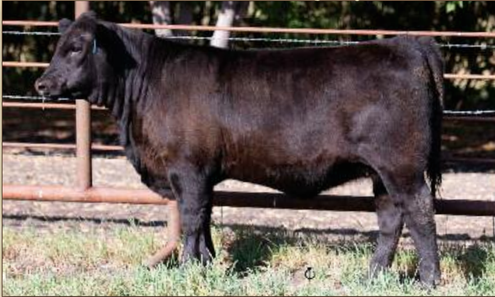
LOT #35 - YCF HALLEY 95H