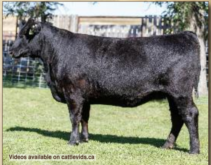
Videos available on cattlevids.ca

These are all grassroot attributes that should not be overlooked when adding genetics into your program.