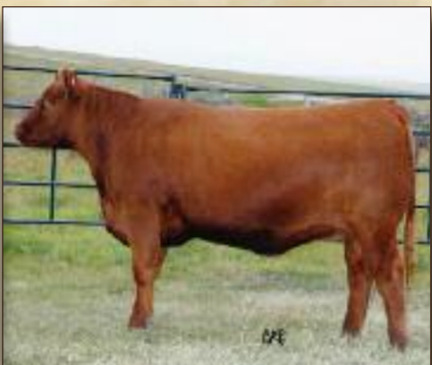
VIDALIA 24Y (AS A HEIFER)