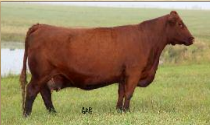
MARIA 53A - DAM OF LOT #31 EMBRYOS

Red MRLA Upload sired the $17,000 heifer calf at the Red Roundup last fall!