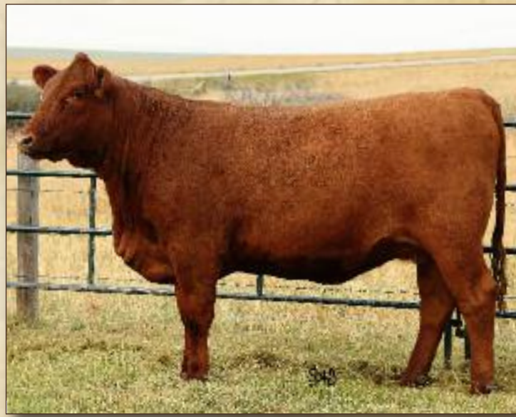
LOT #28 - 210G

Some totally different blood here folks... and quite possibly the very first Domain sired female to sell in the entire country. Weighing 1070 lbs. on her Yearling Weight on March 22nd, she is full of raw horsepower and great length of body. I think the service to the Howe bull will enhance this heifer very nicely.