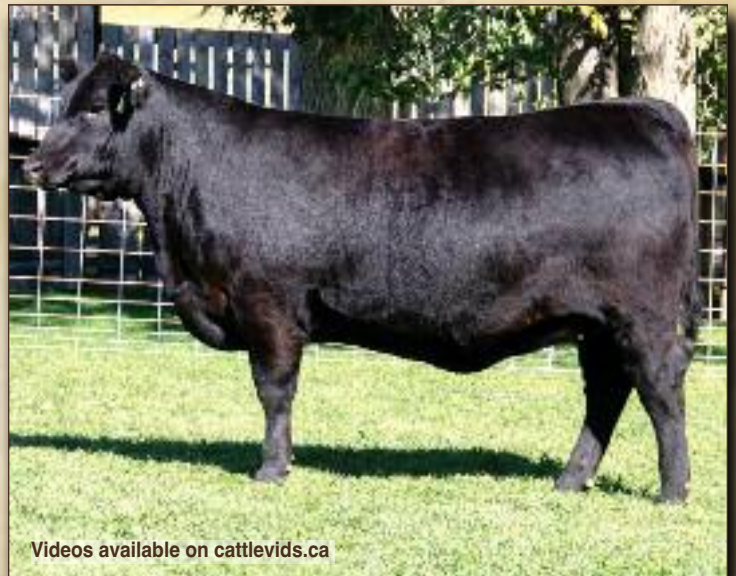
Videos available on cattlevids.ca

This soft made heifer is "flat out good" with lots of eye appeal that would be a top contender on the show circuit and a great addition to your front pasture