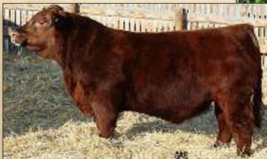
RECKONING 149A - SIRE OF LOT #45

You have to love 405's front end and face, it is one of those females that you could sit and look at all day. She is one you will want to take advantage of, to grow that sound cow herd with.