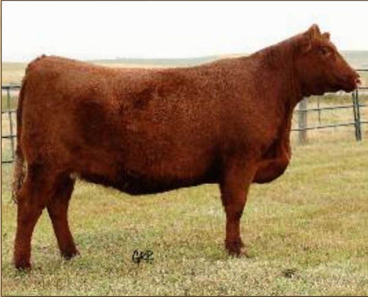
LOT #24 - RED BRYLOR OTM YALEY 202G