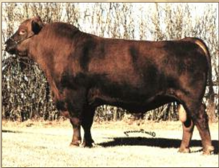
NEW TREND 22D - SIRE OF 230U