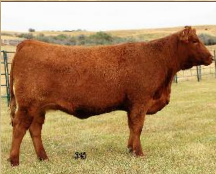
LOT #25 - 257G

If you can only circle one in the book on October 24th, then 202G is not a bad choice!