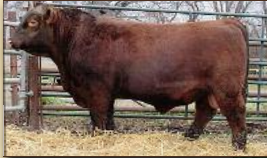
COPENHAGEN 653C - SIRE OF LOT #44