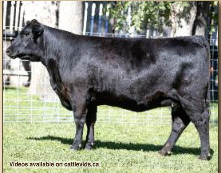
Videos available on cattlevids.ca

Fleming 929 Miss Essence is a bigger framed yet feminine female who is clean fronted and free moving. She is square made and long. She has longevity, performance and the predictability of old proven genetics in her pedigree with Vermilion Dateline 7078, Vermilion Yellowstone, Fleming 921 Jena, the lineage of the Willabar and Essence cow families and influence of Garrison 8128 Dynamite. Old genetics have a place when building a cowherd, "take the best of the old to create the new"!!