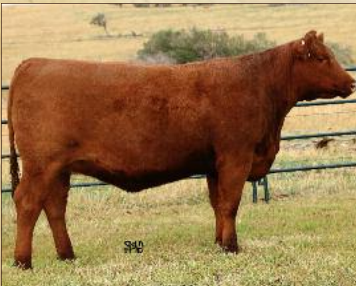
LOT #21 - RED BRYLOR 21Y NIKITA 55G

Compass 41B is a maternal brother to Final Deal. 40X has a feature heifer in Red Roundup this fall for WRAZ and had Phil's high selling bull this spring at $10 grand (an Assassin ET)