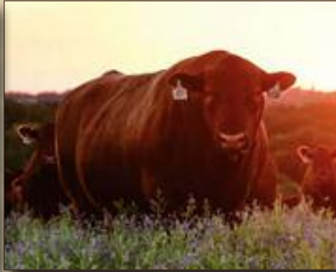
POWER EYE - SIRE OF LOT #29 EMBRYOS