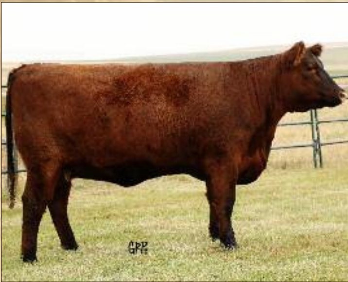
LOT #11 - RED BRYLOR 258A GOLDIE 3G

The hair on this female right from birth to just the other day when we clipped these cattle was amazing!