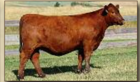
STARTLET 403F - DAM OF LOT #46