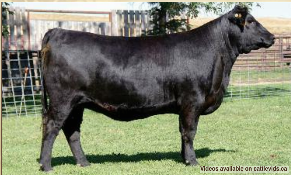
Videos available on cattlevids.ca

As well, on the dam side she has the proven longevity and female building genetics of High Valley 4C6 Ambush and Garrison 8128 Dynamite. RJL 914G is a free moving female who is bigger framed yet feminine in her make up.