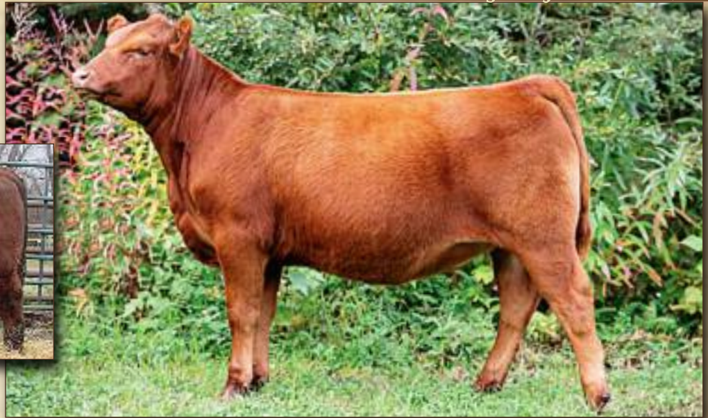
LOT #44 - RED DELTA GOLD EDGE