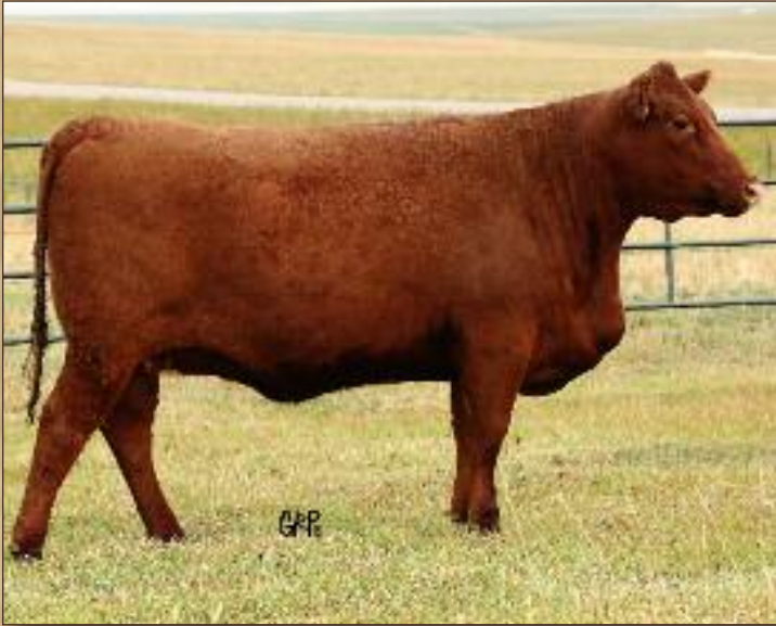
LOT #19 - RED BRYLOR 95Z ANNIE 27G