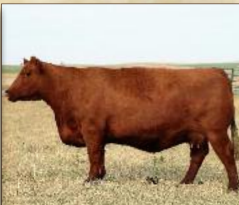
NIKITA 97Y - DAM OF LOT #13