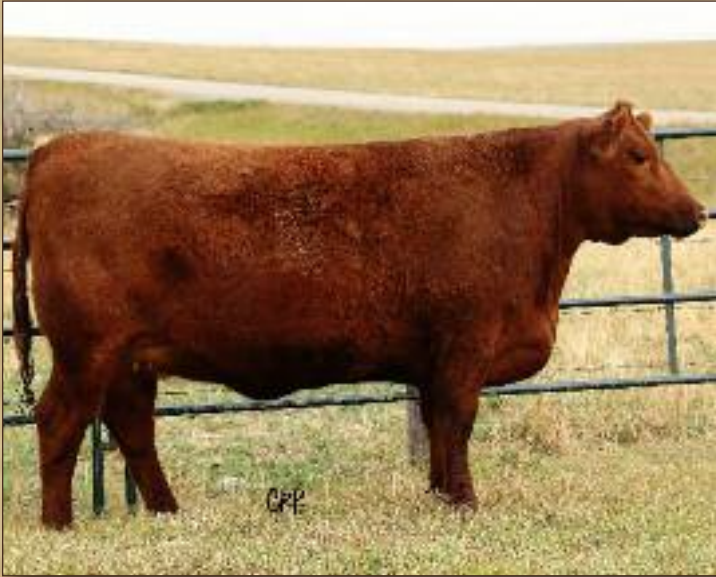
LOT #10 - RED BRYLOR LANEY 2G

All of the next 19 heifers were exposed May 1 - June 3 to RED HOWE HEAD GAMES 56G