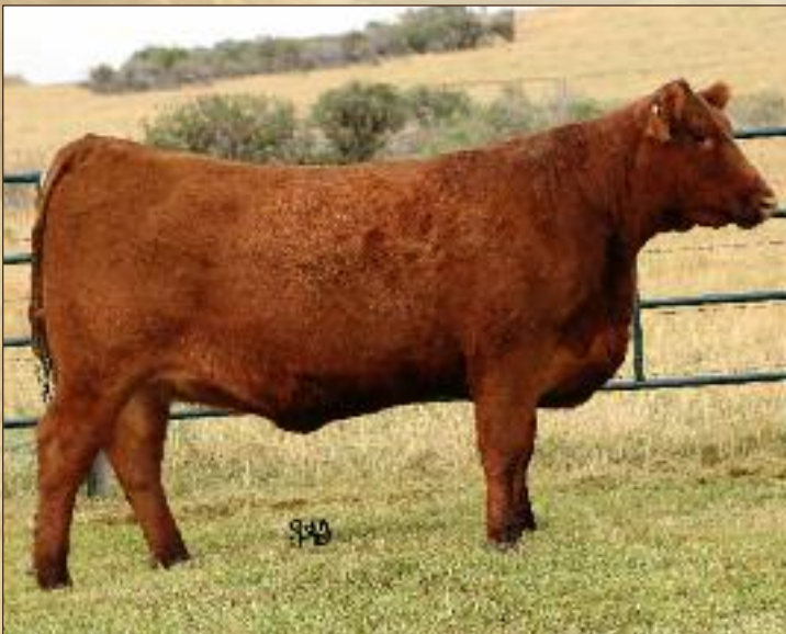
LOT #15 - RED BRYLOR 183E TRINA 12G