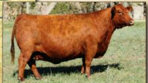
MABLE - DAM OF LOT #7