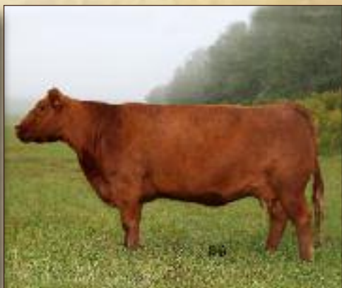
VIDALIA 24Y (AS A MATURE COW)