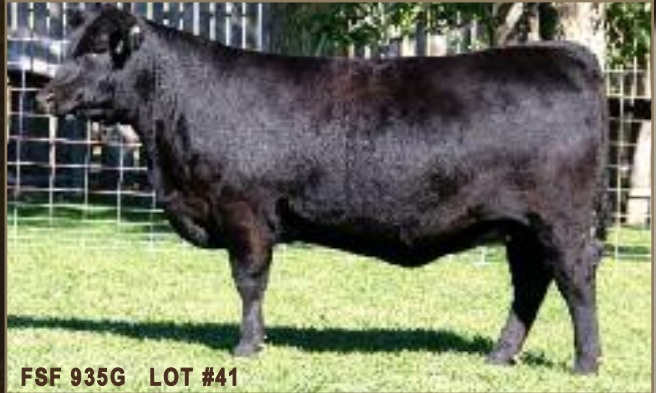
FSF 935G LOT #41