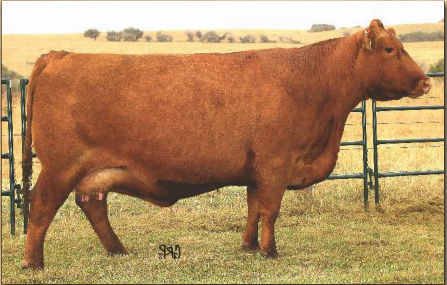
LOT #3 - RED MEM BAYBERRY 27X