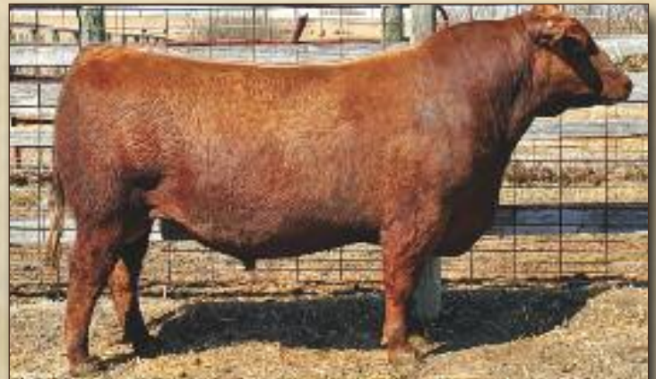
FRANCHISE 149F - SIRE OF THE LOT #31 EMBRYOS