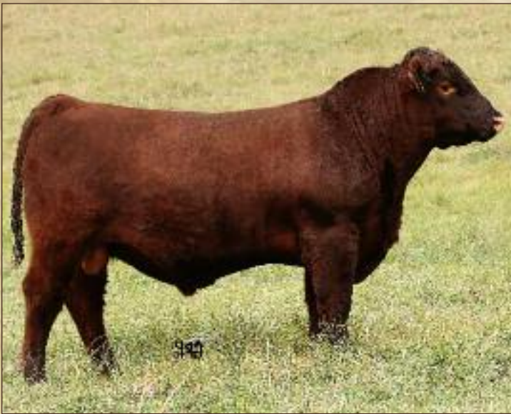
SERVICE SIRE B - RED HOWE HEAD GAMES 56G

See Lots #32 & 33 for more on his dam and grandam.