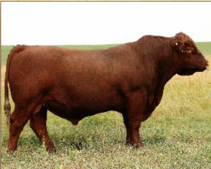
SERVICE SIRE C - RED TER-RON FREEWAY 134F

We are looking forward to big things from this very well put together, sharp young sire!