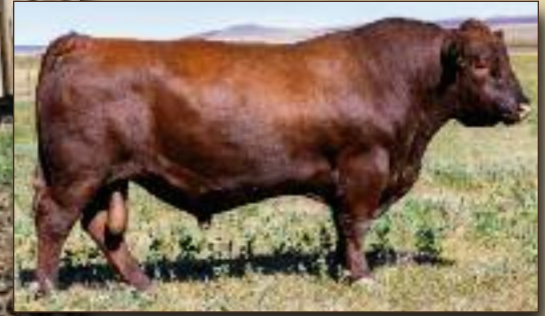
BIG SHOT 118E - SIRE OF LOTS #50 & #51