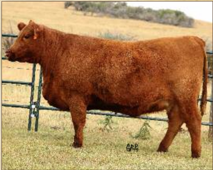
LOT #23 - RED BRYLOR OTM BOWBERRY 203G

I believe this will be a good match with the Service Sire, Head Games 56G who has style coming out of his ears.