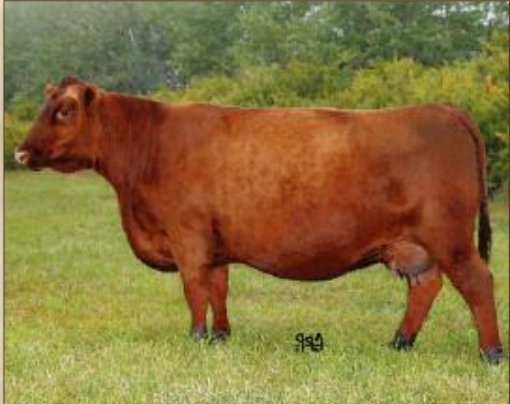
39U - DAM OF LOT #18

Have you had a tour at Stauffer's to see the daughters of Waterton? They are gorgeous females! Deep dark red and oh so broody is 21G.