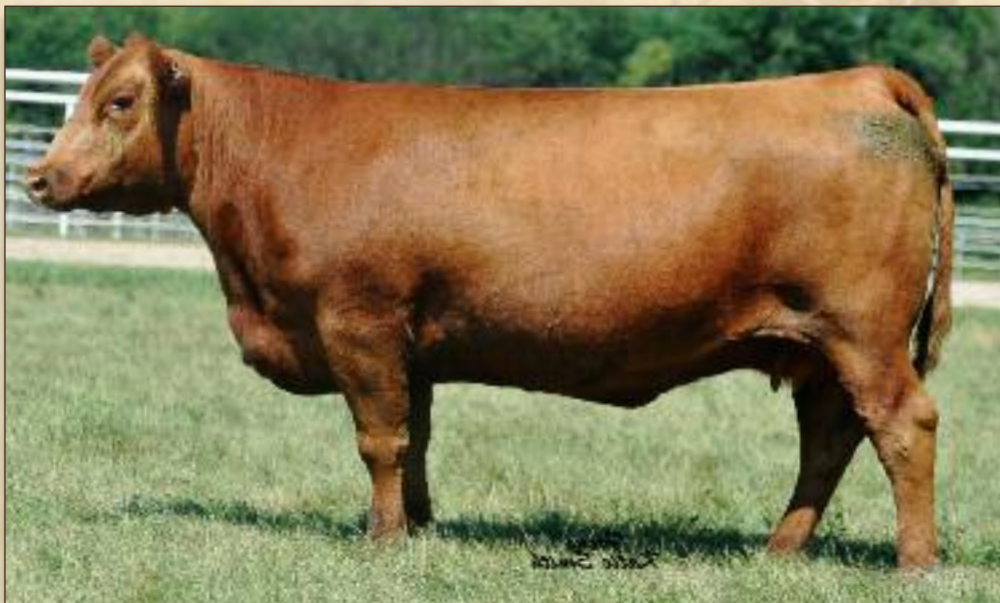
RED MCRAE'S REBA 49W - DAM OF LOT #33 EMBRYOS

49D, an own daughter of Mark's signature cow, 49W, will be on display at the sale in Stavely.