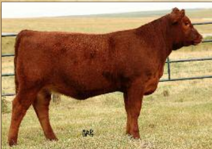
LOT #4 - RED BRYLOR 27X BAYBERRY 4H (DAUGHTER OF LOT #3)

The Service Sire, Resource, has lit it up big time the last couple of years in both sexes. The bulls have sold very strongly including the $130,000 Township bull to DVC of Sundre. The daughters as heifer calves in the U2 Dispersal must have averaged over 10!