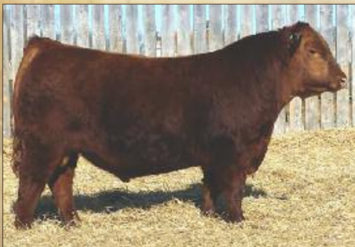
ASSASSIN 624D PICTURED AS A YEARLING