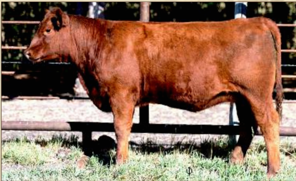
LOT #36 - RED YCR YOAKAM 2063H

The functionality of Halley 95H will allow her to fit into any herd quite nicely.