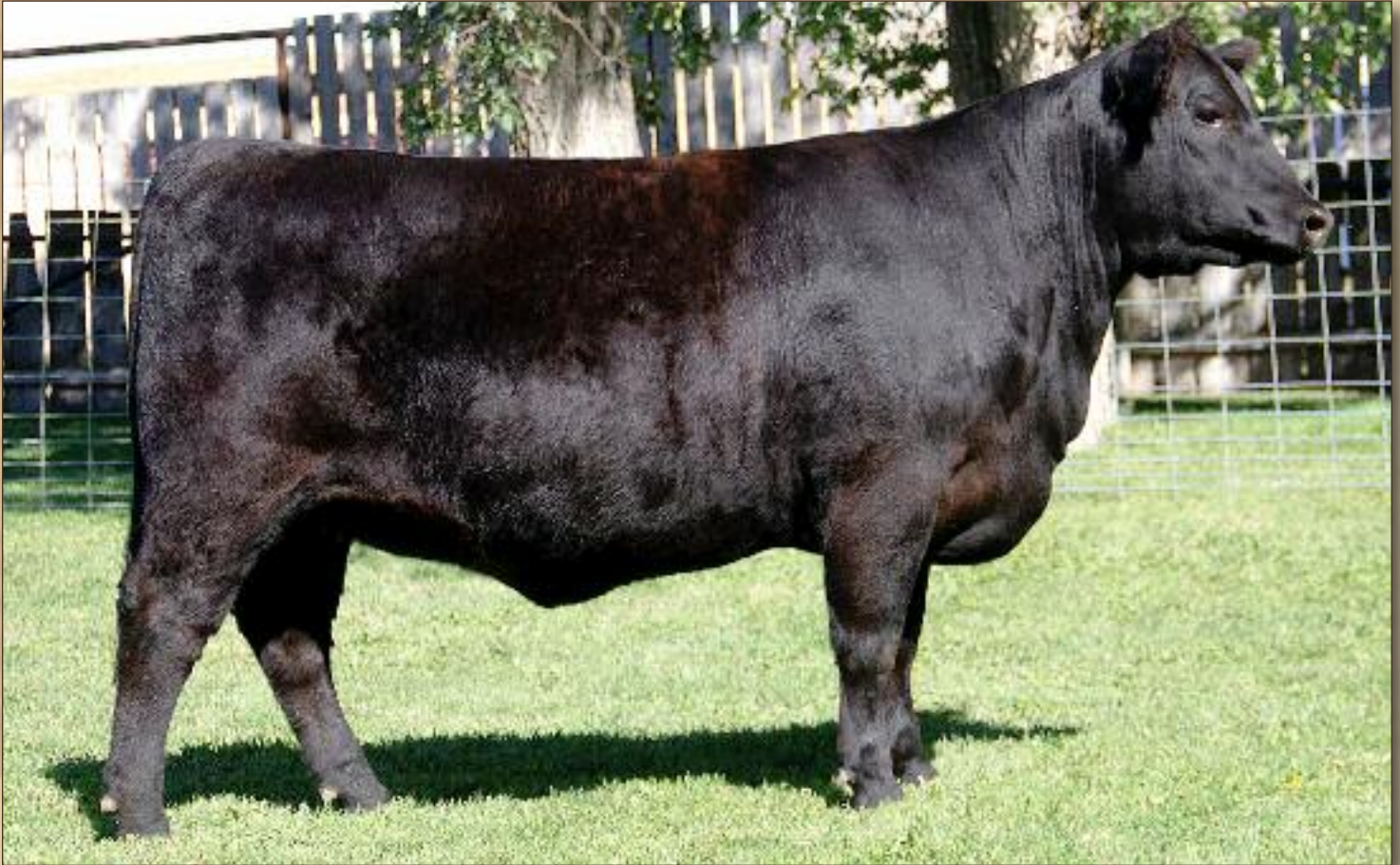
LOT #37 - FLEMING 912 JENA SPUR