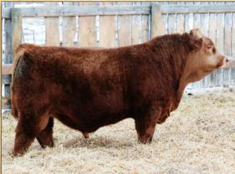
RDD 75F - SIRE OF LOT #34

Note - Registration eligible as a halfblood at the CSA office if the new buyer so wishes.