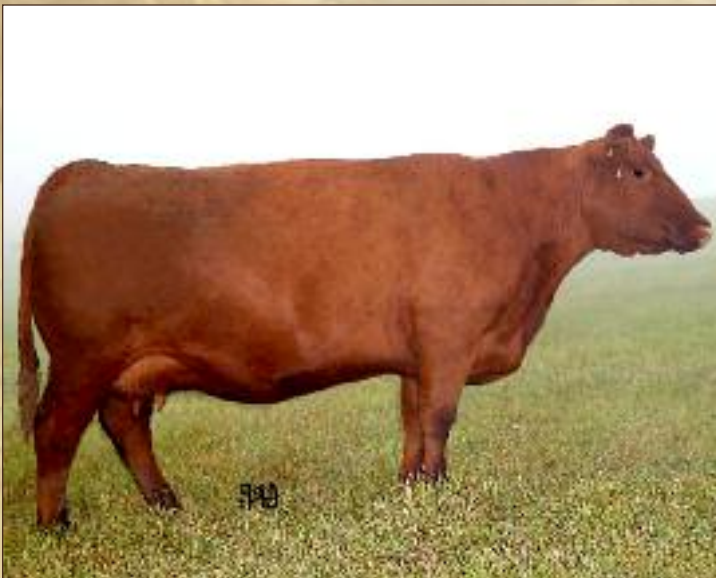
40X - DAM TO LOT #20 - RED BRYLOR 40X SHEBA 35G

This is a really dark red solid kind of a heifer that comes from an excellent cow base of Annie's. Her dam, 95Z, combines some of the best bulls all in one paper that were used for the last couple of decades. Arson ($17,000 high seller at SSS), Bodasius 79K (and ET son of Bodacious and our dear old 40X cow. Final Deal takes the birthweight away like no other bull we've ever used before here at Brylor. This one is hard to see go!