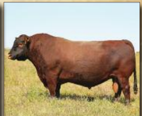
FINAL DEAL - SIRE OF LOT #13