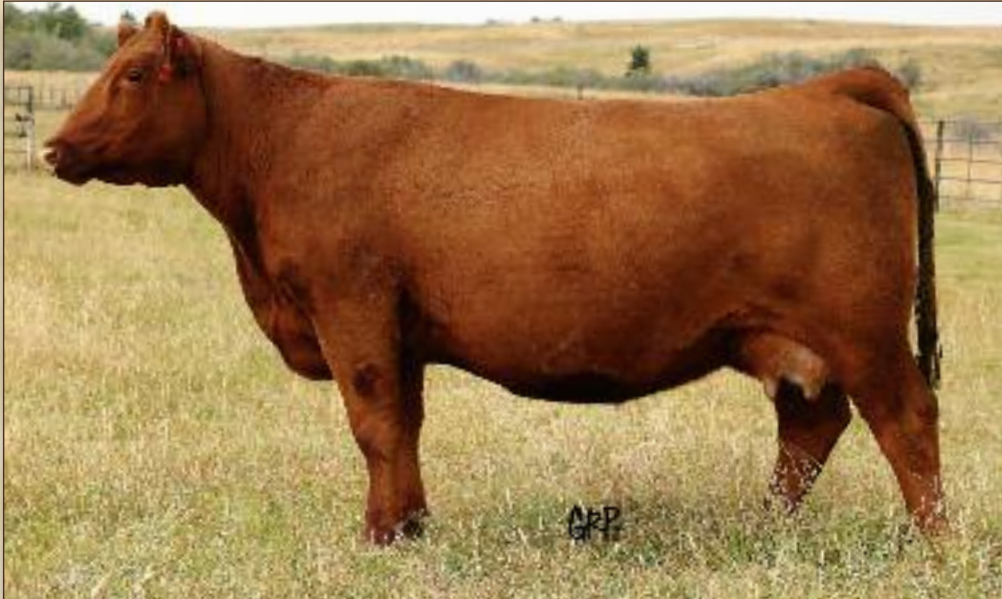
RED BRYLOR OTHC REBA 49D - DAM OF LOT #32 EMBRYOS