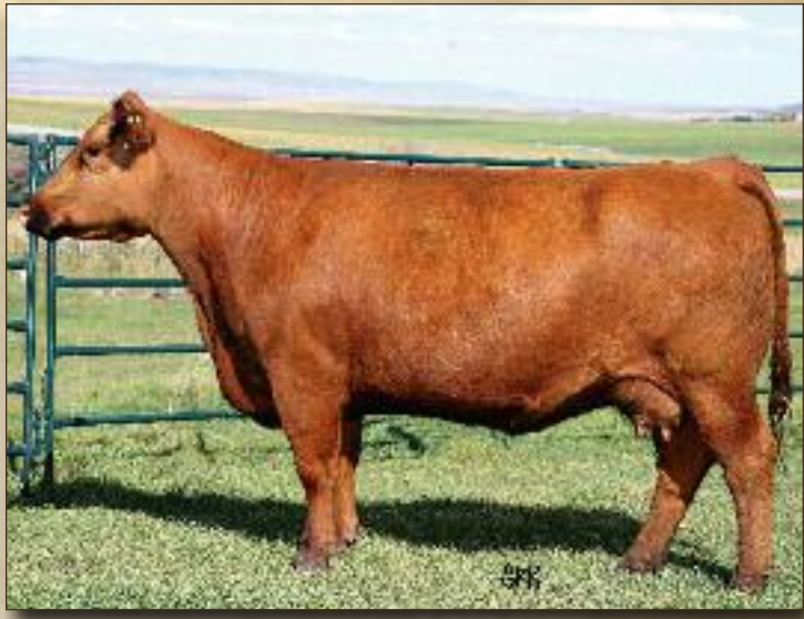
230U - DAM OF 408C