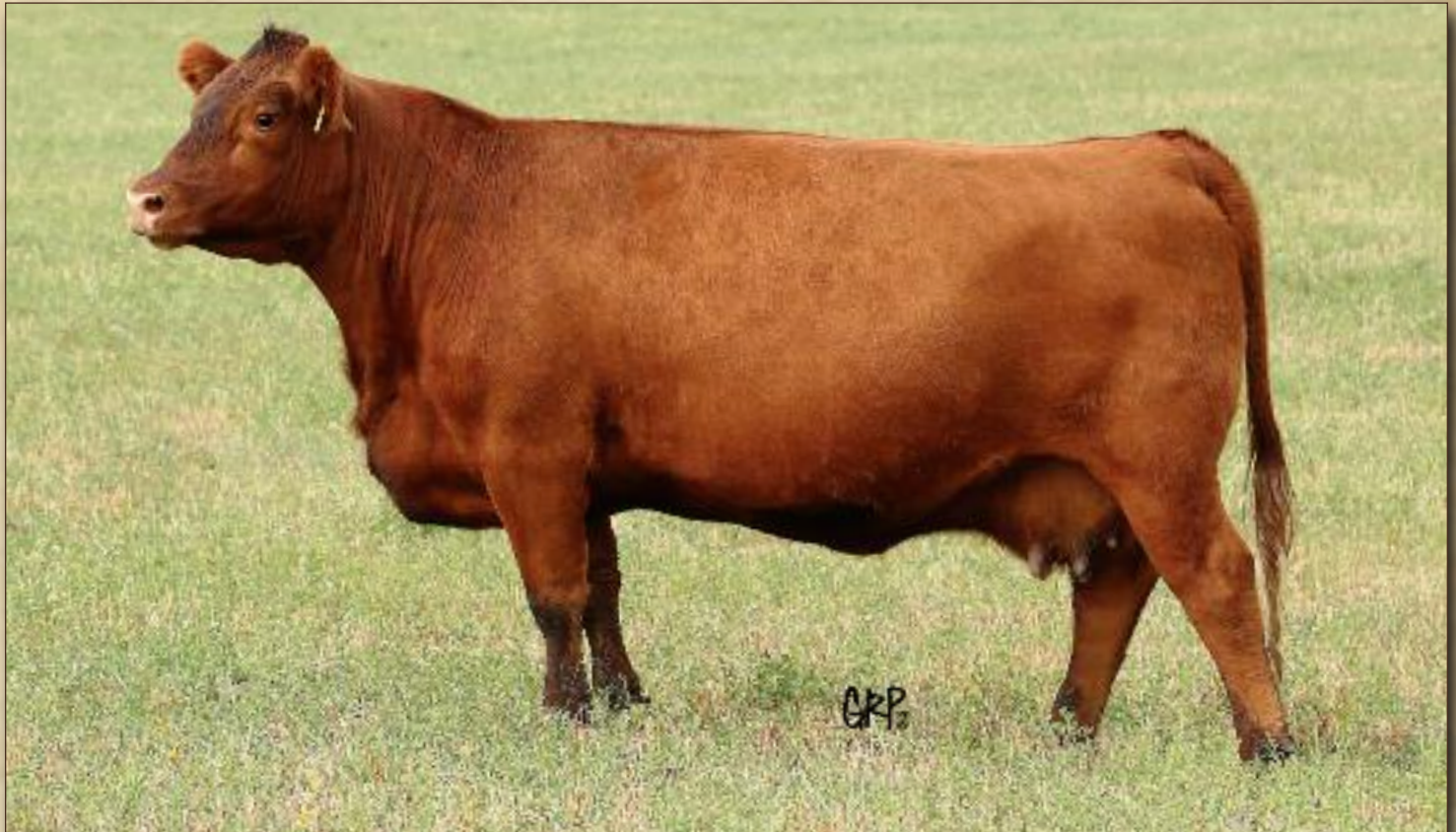
LOT #8 - RED BRYLOR LULUWILL 128Z