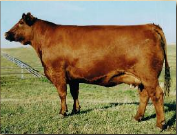
ESSENCE 42G - DAM TO 230U