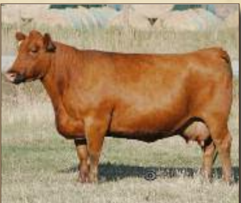
3T - FULL SISTER TO DAM OF LOT #13

BE SURE TO CHECK OUT THE SALE VIDEOS AT: www.brylor.com